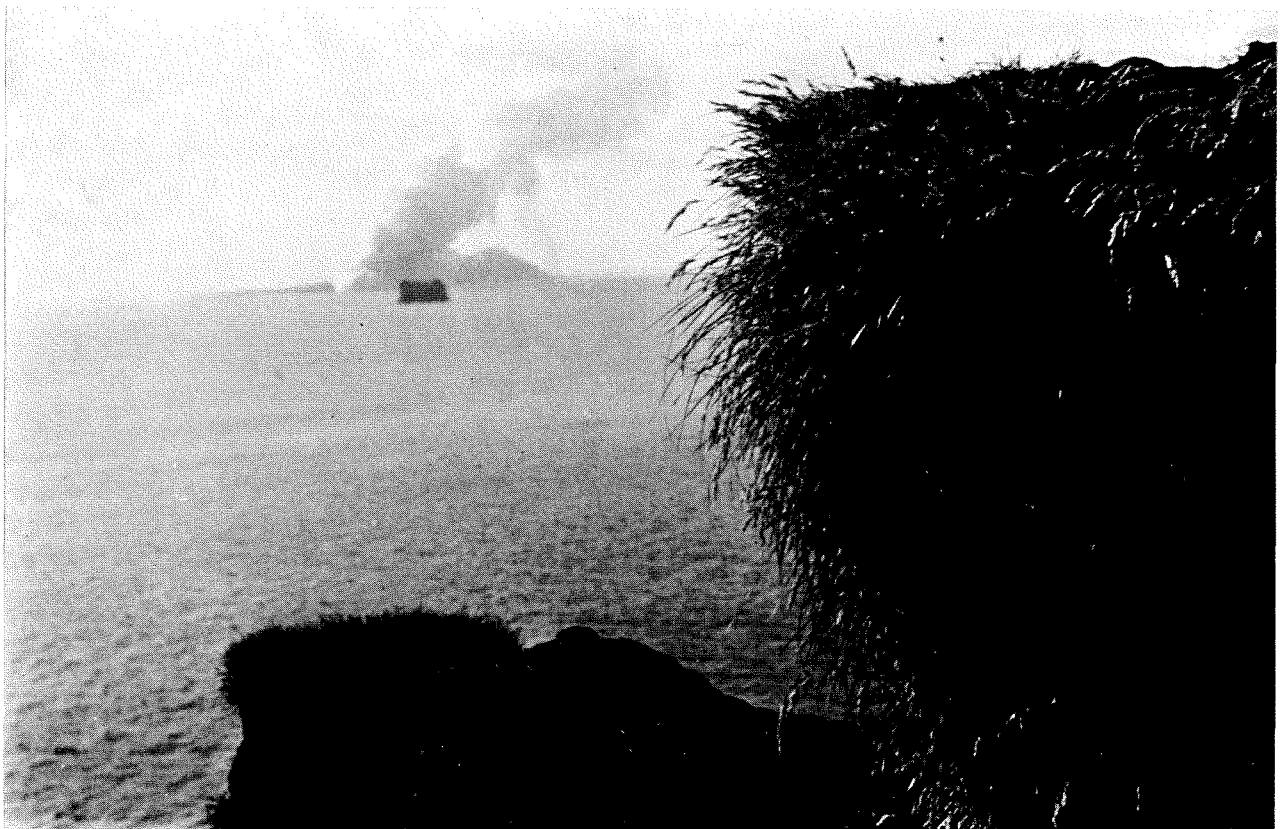
Fig. 1. A tuft of Festuca rubra hanging over the cliffs of Súlmasker. The rock of Geirfuglasker and Surtsey erupting are seen in the distance.

The vascular plant parts were mostly of the same species as discovered in previous years. Nine of the species are found growing on the neigh-